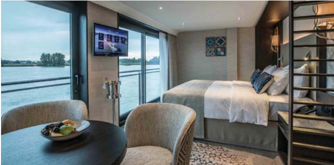
Category 5 cabins (300 sq. ft.) feature a pull-out sleeper sofa, floor to ceiling windows and French balconies.