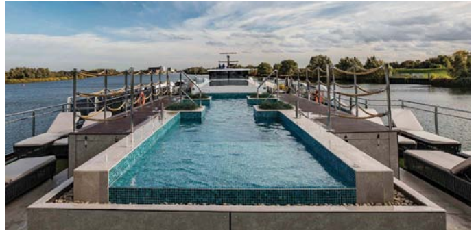
An infinity-style heated swimming pool on the Sun Deck is the perfect place to unwind.