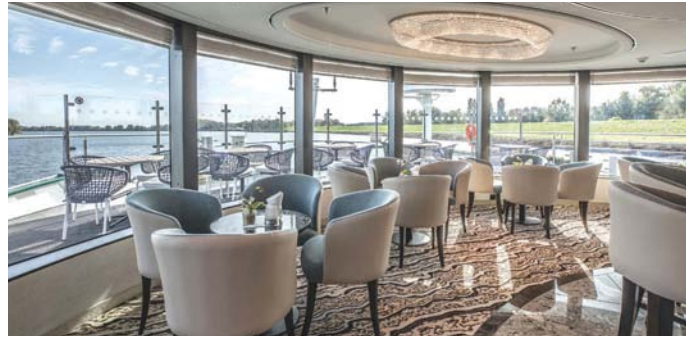
The Panorama Lounge is aptly named with its large, expansive windows and comfortable seating.