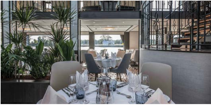
Dining in the Compass Rose is memorable, and the cuisine often features regional specialties.